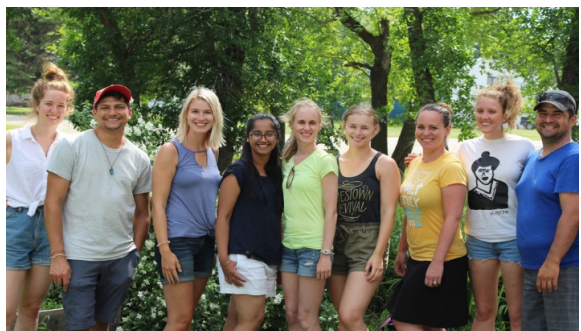
Figure 2. Students and course organizers in Sociology 3460 class

As a six-week-long summer institute introducing students to ethnographic methods, two of which happen (literally) in the field, this course offers an example of what Sarah Pink and Jennie Morgan (2013) call “short-term ethnography” (see Figure 2). This approach is very well-suited to intensive and visually-supplemented fieldwork. Ethnographic