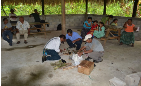
Figure 3. Preparing for ceremony to seek support for the film project

they wanted to talk to their people, and then the government and medical establishment. Therefore, the film should be in their language. But when they realized that few non-Q'eqchi' would be able to understand such a film, people such as government policy-makers and the medical establishment, I explained the idea of English sub-titles, which reassured them.