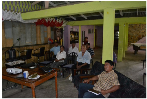
Figure 8. Members of the Maya Healers Association viewing the rough cut

I then traveled to southern Belize, where we celebrated the film’s “world” premiere showing with the iloneleb’ and their families in the same bar. Again, the audience showed little enthusiasm save for the end when one of the practitioners appeared playing his homemade fiddle while the credits rolled, and everyone laughed. The children seemed a little bored even though their fathers, mothers, and other family members were on TV. But in the end, there were smiles, followed by a feast and dancing. I was now certain that the film had met their expectations. I had got it “right.”