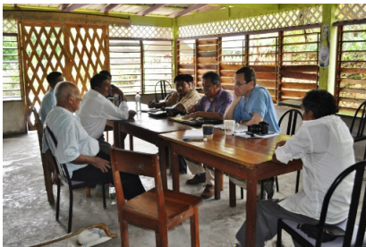
Figure 9. Post-viewing discussion of rough cut

We moved over to a table and opened a discussion about the film. No one commented on the aesthetics, the artful scene transitions, the soundtrack, the unfolding compelling narrative. They were concerned with the accuracy of the presentation, and whether or not the film would help them achieve their goals. Did I get it “right” from their perspective? They had several very concrete suggestions to amend the film, mostly some inclusions (such as showing more treatment paraphernalia because the police kept rousting them on suspicion that their technological items and plant medicines were somehow illegal). After the meeting, when I asked a Q’eqchi’ colleague if they liked the film, because I could not tell, he responded with an emphatic “Oh yes!”