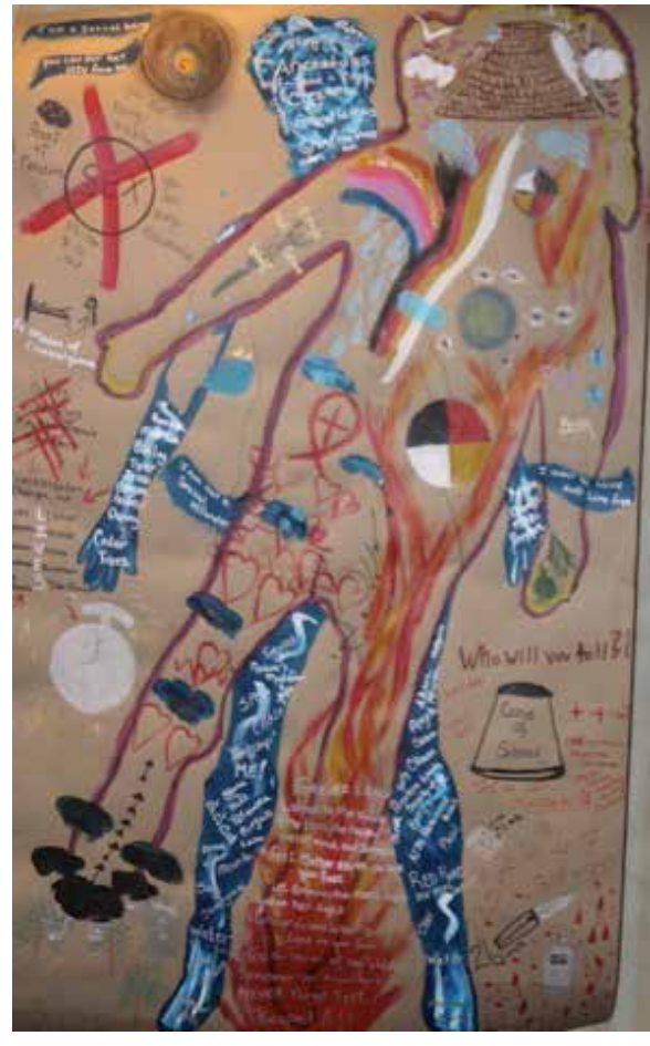
Figure 1. Valerie Nicholson's Body Map (WATCH Study, 2015)

as data in themselves, supplemented by recorded reflections, or writing. Body Maps communicate feelings and experiences to raise awareness about political, personal, social, legal, and public health issues (Solomon, 2007). Ideas and issues can be explored which may be more difficult to access through verbal discussion alone and can free interviews from being intrusive (Rothe, Ozegovic, & Carroll, 2009). Body Mapping can trigger emotional memories, yet it is also an opportunity to celebrate courage and strength (Cornwall, 1992). For the women who participated in our Body Mapping workshops, emotional memories and current day concerns as well as experiences of resilience and resistance, were represented on the body maps and through sharing circles that the women participated in at the end of each day of art making. On the last day, women also shared their reflections on their experiences of engaging in the body mapping workshops stating that it was both an emotionally challenging and healing experience, and that they would want other women in their communities to experience the body mapping process. As Judith shared: