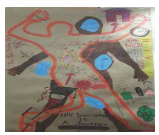
Figure 2. Marvelous Muchenje Body Map (WATCH Study, 2015)

with my thoughts—I felt their pain, I cried when they cried, and laughed to the jokes we shared.