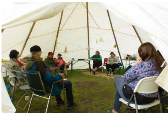
Figure 6. Participants in the kâniyâsihk Sharing Circle, sharing their words.

2019). nêhiyawak Elders have also shared with us that when we introduce ourselves, we are introducing ourselves as our Spirit through the connection to our mother, the umbilical cord connected first through our belly button, and that that spiritual connection is passed from our mother and our matrilineal ancestors, such as our grandmother, our grandmother's grandmother, and all the way back to Spirit and Creation.