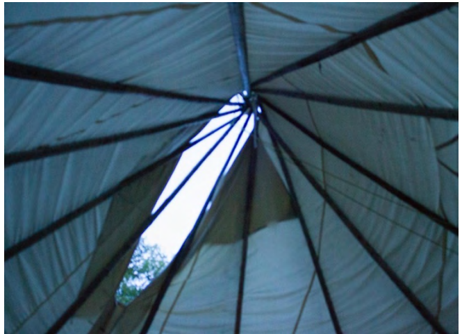
Figure 2. The inside of the teepee at kâniyâsihk Culture Camp, where we held the sharing circle.

Linda Tuhiwai Smith (2012), the renowned Māori research theorist, posits communities as “physical, political, social, psychological, historical, linguistic, economic, cultural, and spiritual spaces” (p. 215). Where Smith makes the distinction between community-based projects and those afforded through academic spaces, the Spirit of the Language project works in both academic and Indigenous spaces. “There are also protocols of respect and practices of reciprocity,” continues Smith (2012): “Consent indicates trust and the assumption is that the trust will not only be reciprocated