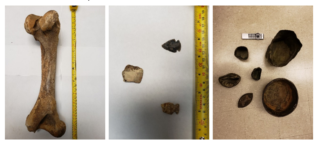
Figure 6. Indigenous artifacts borrowed from communities.

All interviews were recorded with the permission of interviewees by two voice recorders simultaneously. Some interviews were conducted in Cree, while others in English. The oral stories were transcribed by research assistants.