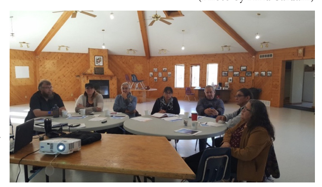
Figure 2. Workshop in Sturgeon Lake, Sturgeon Lake First Nation Healing Lodge, October 22, 2018.

(FNUniv) and the University of Regina (U of R), our proposal was reviewed by the U of R Research Ethics Board and granted certification on July 17, 2018 (ethics REB#:2017-199).