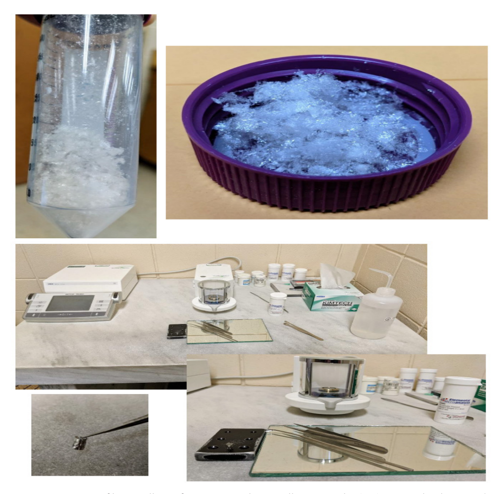
Figure 7. Preparation of bone collagen for isotope analysis. Collagen samples (top) are weighted into 6×4 mm tin capsules (≈0.5 mg per sample).

Carbon and nitrogen stable isotope analyses of bone collagen were conducted in the Saskatchewan Isotope Laboratory at the University of Saskatchewan by Dr. Sandra Timsic (Figure 7).