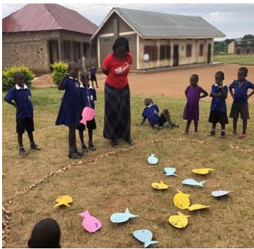
Figure 2. Illustration of Children in Uganda Playing Fishing for Rights.

divided into three groups, each of which engaged in an activity for about 20 minutes before rotating so all activities were undertaken by all students.