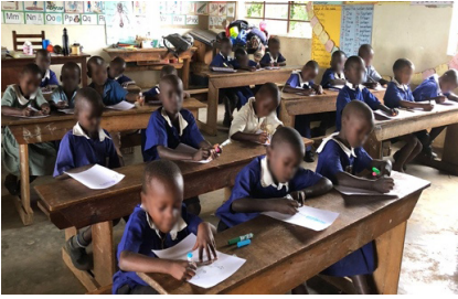
Figure 4. Students in Uganda Drawing Their Postcards.

Equitas, 2008). Students then wrote letters to children in the other class (See Figure 4). In keeping with the workshops, they were encouraged to add drawings depicting the rights they felt were most important to them. On the other side of their pictures, they wrote a letter based on the following template: