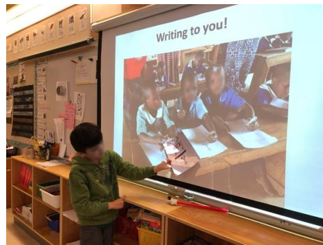
Figure 7. Children in Canada Showing Postcards Received from Students in Uganda and Looking at Pictures of Children Writing Postcards in Uganda.