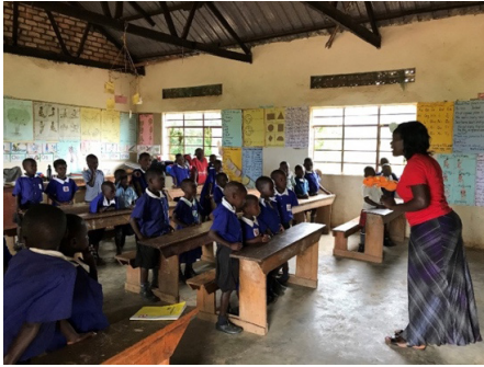
Figure 1. The Facilitator/Teacher Introducing Nunu the Puppet in Uganda.