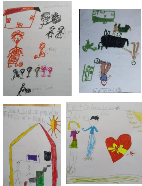
Figure 5. A Selection of Four Pictures Created by Students (from Left to Right) in Uganda, Canada, Uganda, Canada.

The third activity included writing postcards to their political leaders, either President Yoweri Museveni or Prime Minister Justin Trudeau. This allows students to express their right to a voice in matters that impact them (as outlined in Article 12 of the UNCRC). The postcard invited them to create and share a picture expressing a right that is important to them (based on