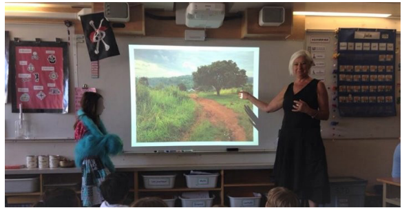
Figure 6. The Facilitator/Researcher and a Young Student Helper Sharing Information about the School and Community in Uganda with Students in Canada. Photo by Shelley Jones

Then the children were given time to develop their letters. They had several days to complete these, as shown in Figure 7. The session then closed with another circle where the children cooperated to move the hula hoop around the circle without breaking the link.