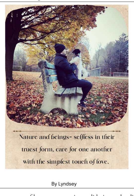
Figure 8. Zine Submission

Note: Importance of human connection, solidarity, and radical care.