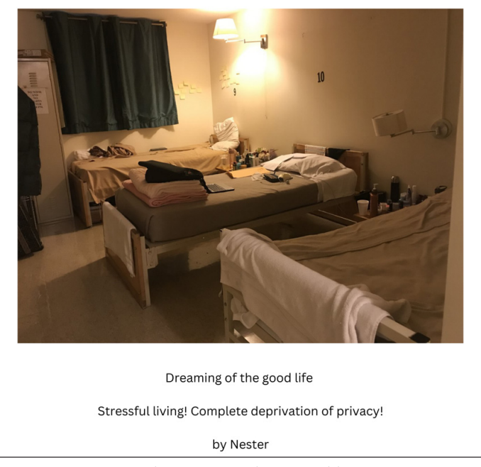
Figure 6. Zine Submission

Nester's submission entitled "Dreaming of the good life" shows a bedroom with three single beds in a small room that appears to be a shelter space. The caption attached to the photo reads "Stressful living! Complete deprivation of privacy!" (see Figure 6). Good living can be understood here as the opposite of stress and a lack of privacy.