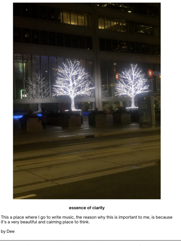
Figure 3 . Zine Submission

Note: Affective and psychological strategies of resistance.