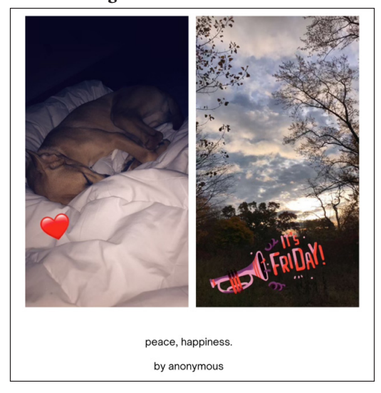
Figure 5. Zine Submission

In a submission by anonymous (see Figure 5), we see two images. One of a dog curled up in a white duvet and another of outdoor scenery with trees and the caption "It's Friday" triumphantly exclaimed from a trumpet. Both images are captioned under the title "peace, happiness", both markers of good living. They are also attached to a bed in a house, and perhaps the end of the work week, which also suggests that good living is tied to labour practices that ensure breaks and rest for workers.